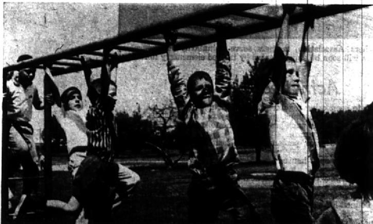
A physical education program is planned for the elementary children. Playground activities and equipment help each child develop coordination and build up muscle strength, important aspects for good health.

An intramural and varsity sports program has been established as after-school activities supplementing classroom instruction.