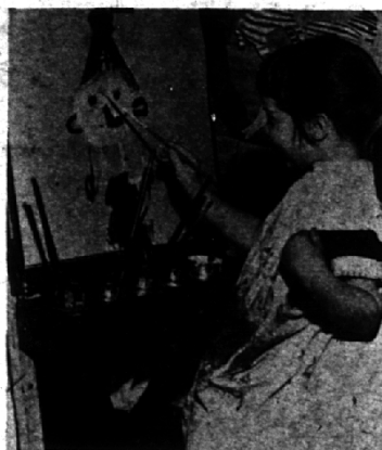
Children enjoy experimenting with water colors. This develops coordination, discrimination, experience in a new media, and the opportunity to create something all their own.

Helping teacher services 1-6 grade General Art Crafts Ceramics Weaving Drawing and Painting