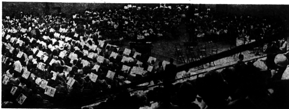
The Birmingham student can participate in instrumental music instruction from the time he enters the fourth grade until he is graduated from high school. The annual concert

Eighth grade general music changed from a required to an elective course.