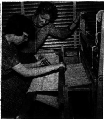
Weaving with a hand loom affords another outlet for artistic expression at the senior high school level.