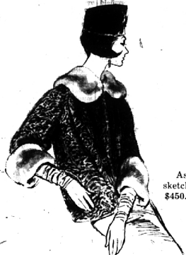
As sketched $450.00

OPEN 9:30 TO 5:00 DAILY MONDAYS UNTIL 8:30