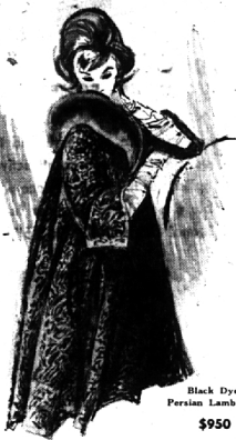
Black Dyed Persian Lamb Coat $950

OPEN 9:30 TO 5:00 DAILY MONDAYS UNTIL 8:30