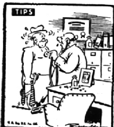
"Sounds a lot like a car I took to a garage in the Want Ads — his head had to come off!"

ADDITIONALLY, the convenience package, optional on the basic Comet, is standard equipment on the Custom series and includes bright horn ring, deluxe steering wheel, cigar lighter, door-operated interior lights and rear-seat arm rests and ash trays.