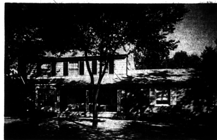
NEAR QUARTON SCHOOL

The type of ranch you want for your next move. Family room, superb kitchen with built-in oven and range, breakfast nook, really large utility room. The foyer has a slate floor, there is an oversized, 2 1/2 car, attached garage. The home, of brick construction, is situated on a landscaped knoll. Ideal environment for children, well priced at $33,900.