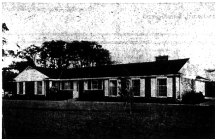
4 BEDROOMS, 2 1/2 BATHS

The owner's transfer is your good fortune. Here is a beautifully maintained 3 bedroom home with especially desirable features such as the large bay window in the living room, huge patio, fine landscaping, and blonde recreation room with a bar. Walking distance to schools, shops and churches—superb value!