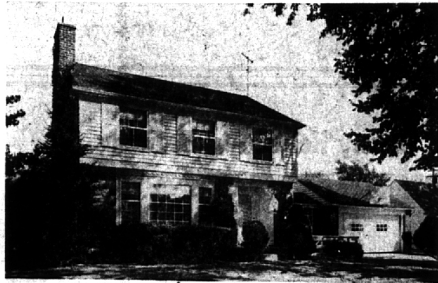
$28,900 — FIELDSTONE COLONIAL

Hayes said a continuing fund could be allowed for in the budget out of a general taxation funds under the 7 1/2 mill limitation. In a written opinion, Hayes said such a fund would not conflict with the city charter nor with state statutes.