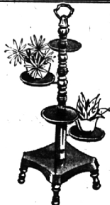
Maple Flower Stand

Colonial quaintness adapted for modern living! Holds flowerpots and "what nots." 12" wide x 12" deep; 36" High.