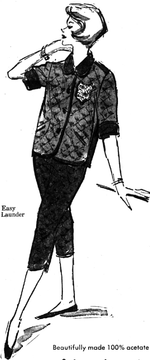
Easy to Launder