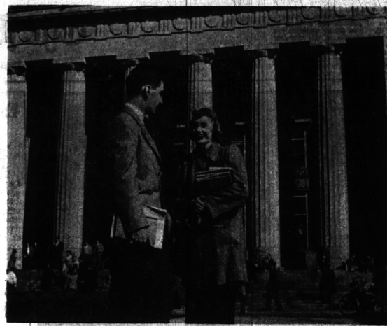
Students in front of Angell Hall, Headquarters of the College of Literature, Science and Arts, University of Michigan

1961 SCHOLARSHIP and TRAVEL-EDUCATION PROGRAM?