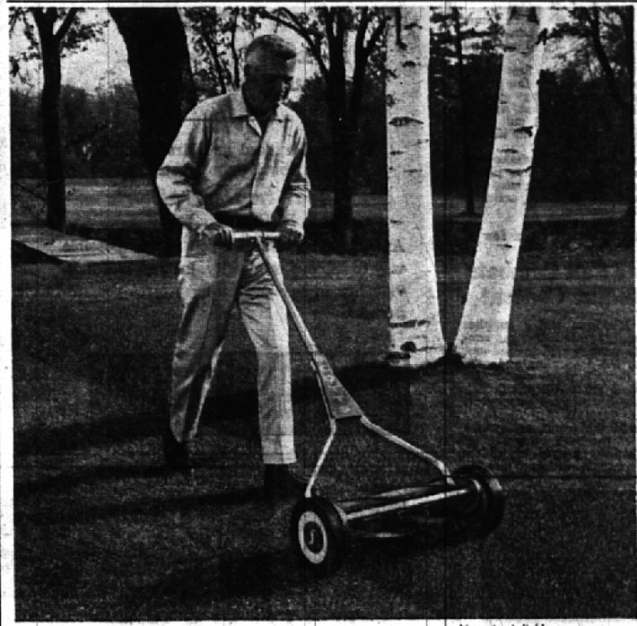
No noisy 'click' as you mow

If you failed to receive yours, please call KE 7-8150 or EL 6-7300 and we will be pleased to mail one . . . or if you are in our store be sure to pick one up.