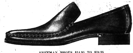
FREEMAN SHOES $14.95 TO $24.95 Also fine selection of Banister Shoes