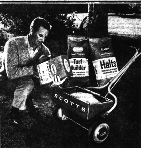
Start your lawn off right