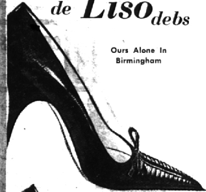
Ours Alone In Birmingham