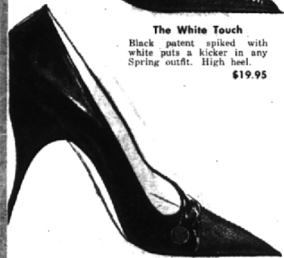
The White Touch Black patent spiked with white puts a kicker in any Spring outfit. High heel. $19.95