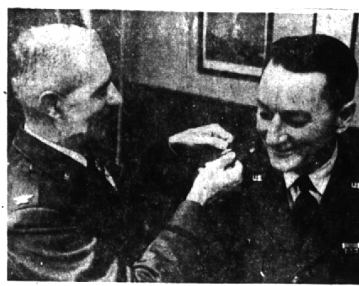
Earns New 'Star'

To the Editor: It has come to my attention as president of the Michigan Society of Neurology and Psychiatry that the Child Guidance Clinic in Birmingham is in danger of being closed, because Oakland County has not provided sufficient funds to supplement that provided by the State. Our society has not had time to express itself in a formal resolution about this matter, but I feel sure that the majority of our members would feel about it as I do. It would be indeed regrettable if this Clinic were to close. NOT ONLY DOES it exist to protect the neighborhood, the school, and the community will benefit from his improved adjustments. Not only is present suffering and tension reduced; the treatment of the child is the best hope we have for the prevention of adult mental illness. If the community is to count closely the dollars it has to spend on the mental health of the child, let it imagine the direct and indirect costs it will later have from the adult. THE CHILD with an unsolved problem may well become the adult with an unsolvable problem. Surely, if the citizens of Birmingham are aware of the situation, they will let the county officials know that this kind of economy is short-sighted.