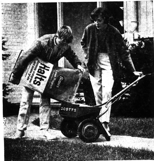
Get the results of an expert