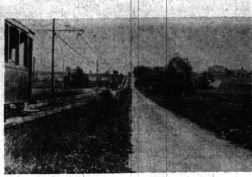
Woodward Transition As times change, so do landmarks as evidenced by this Woodward Avenue stretch between Birmingham and Pontiac in Bloomfield Hills. Rocking smoothly along the straight steel rails, interurban riders once felt superior to travelers on the bumpy dirt road. Today, it just wouldn't do to have the farmer's field (left) surrounding The Kingsley Inn (right) nor the trolley car (left) running through the Fox and Hounds.

Library Story Hours Plan Special Film Baldwin Public Library's summer Story Hours will feature the color film "The Red Balloon" on July 11. The 30-minute program will continue from June 20 to July 25.