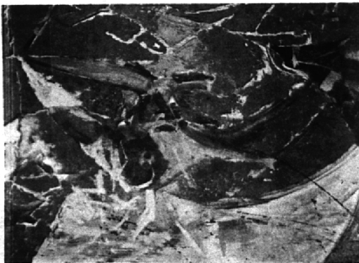
"Gate at Kremanshaw"

See our Maple Avenue windows . . . for a close-up view of fine art