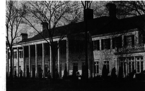
Oakland Hills Country Club This colonial-type mansion will be the resting place for many tired feet during the 61st National Open...