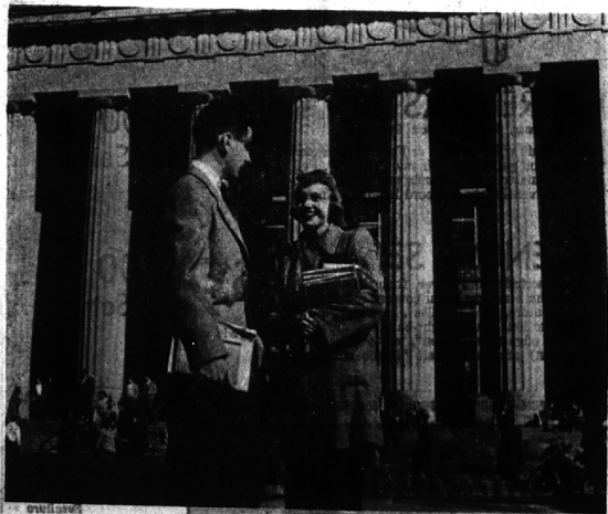
Students in front of Angell Hall, Headquarters of the College of Literature, Science and Arts, University of Michigan

Read the contest rules at left — and fill out the application NOW. Mail or bring it to The Eccentric's Scholarship and Educational Travel Contest Manager.