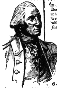
GEORGE WASHINGTON 1732-1799 FATHER OF OUR COUNTRY

Member of the BATHURST NATIONAL CHAPTER, Inc.