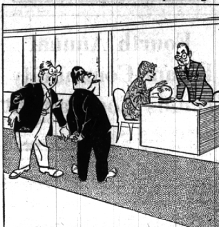
"I'm afraid Grigsby lacks that inner conviction and self confidence!"

someone a moment of pleasure, you will not have lived in vain. Even if you should be ground up in one of those awful machines, the voice falters, "much is good for other trees." The trees appear to draw closer together, bending to catch a last echo to hear only ordinary sounds in the distance. "Straighten up, all of you. Be strong. Bow only to the will of the wind. And remember—nothing is ever lost—never lost—never lost!"