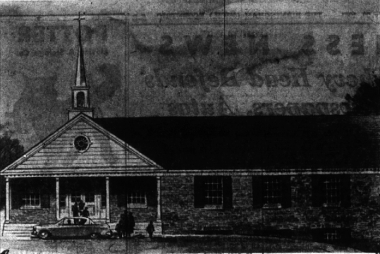
Providing a sneak preview of Bloomfield Ground-breaking ceremony will be held at Hills Baptist Church's new building is this 4 p.m. Sunday at 3600 Telegraph, north of architect's drawing of the $125,000 church. W. Long Lake Road.