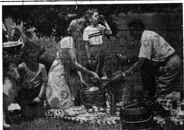
THE FUN OF VACATIONS AND SUMMER OUTINGS MULTIPLY when those exciting moments are recorded on film. Every time the pictures are seen, the happy events are re-lived.