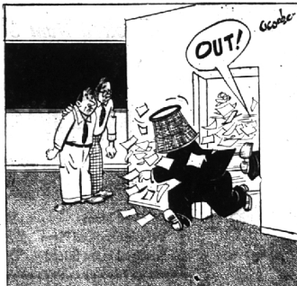
"I told him this was no time to ask for a raise!"