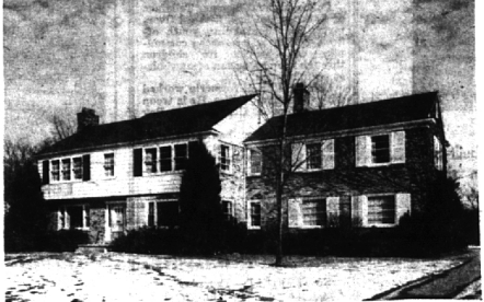
5 Bedrooms, 3 Full Baths Family Room Plus Library

There are very few 5 Bedroom, 3 Bath homes on the market — and here is the best — in the best part of the Village!