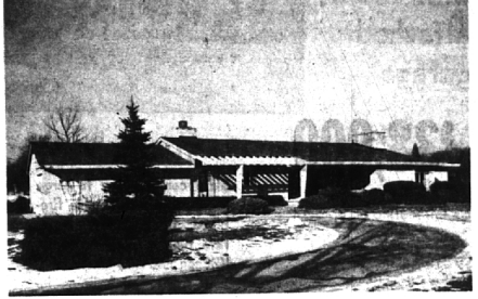
3 Bedrooms, 3 Full Baths Family Room Plus Den

Custom built on 1 1/2 acres . . . spacious rooms and a flowing plan. A 31 foot Living Room!