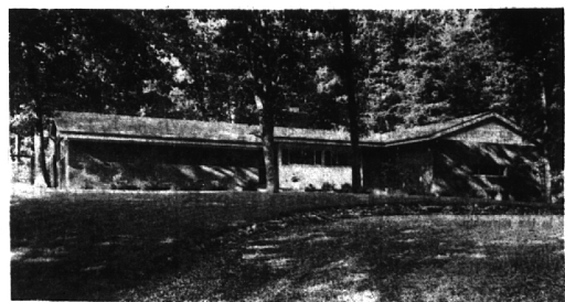
1505 Sodon Lake Drive

A lovely custom-built Contemporary residence in a beautiful wooded setting in the Kirk in the Hills district.