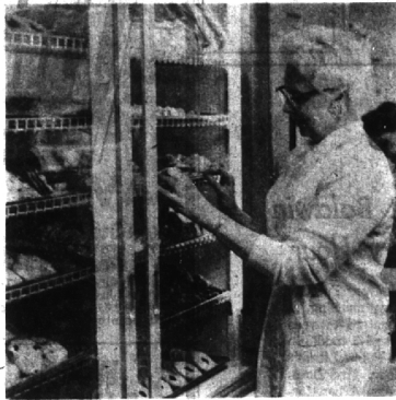
Plenty of Pastry