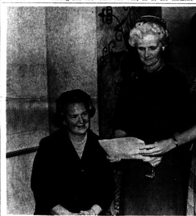
Committee at Work

Good Wishes for the New Year Wish we could say an individual thank-you to the many lovely Christmas cards—one of the nicest things about this time of year. This season's array was quite the prettiest—from the lovely golden Japanese print to the abstract Yule design in muted greens, blues and red. There were the gay carolers to remind one that children all over the world benefited from UNICEF cards, to say nothing of mentally retarded youngsters and others who were helped by thoughtful senders who chose their cards to help their favorite charity. Two gay little cherubs tote a big NOEL sign on another card while on yet another, four little tots bring home the Christmas tree. Well, as we said, wish we could describe them all. Put a Sub Scene right in the mood to wish you all the very best for the coming year.