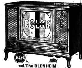
The BLENHEIM MARK SERIES 212-G-94-M 200 square-inch picture

GLARE-PROOF PICTURE TUBE FRENCH PROVINCIAL COLOR TV