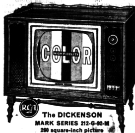
The DICKENSON MARK SERIES 212-G-92-M 200 square-inch picture

THIS YEAR . . . WATCH THE ROSE BOWL PARADE and ROSE BOWL GAME on RCA COLOR TELEVISION!