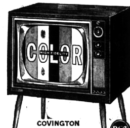
COVINGTON New Vista TV DELUXE Series 212-G-90-M 1 200 square-inch picture