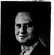
LEE A. IACOCCA