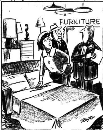
"We'd like one that guests can't endure for more than three nights!"