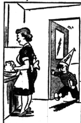
"Is that you Junior? What did my little man learn in school today?"