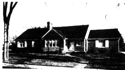
IN BLOOMFIELD VILLAGE

On a quiet street, a site 75' x 320' depth. One of a kind, $45,000.