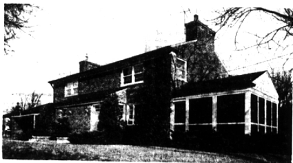
BLUE CHIP INVESTMENT