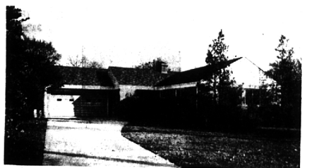
NEAR QUARTON SCHOOL

An all-brick ranch in a special location near Quarton School, the shops and churches.