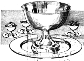
SILVERPLATED DESSERT SETS

Add a note of luxury to desserts and salads... unusual 8-piece set in gleaming silverplate by Oneida has 4 dishes and 4 plates. A distinctive bridal gift. $16.90 the set, including Fed. tax.