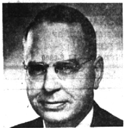
REV. D. ELTON TRUEBLOOD