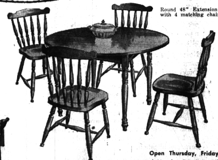
Round 48" Extension Table with 4 matching chairs. $149