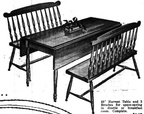
48" Harvest Table and 2 Benches for space-saving in dinette or breakfast room. Complete. $149

Featuring Traditional, Contemporary, Provincial and Colonial Furniture