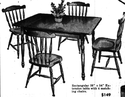
Rectangular 38" x 54" Extension table with 4 matching chairs. $149