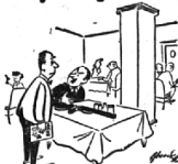
"You have nothing to worry about as long as I get fast service!"