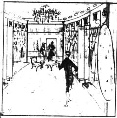
The Cranbrook Room—High Fashions

This Week . . . We are Open THURSDAY and FRIDAY, UNTIL 8:45 P.M.