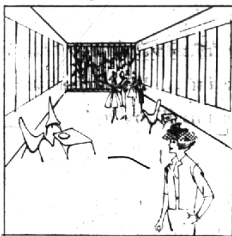
Looking Into the "Birmingham Room" (Assembly Room)