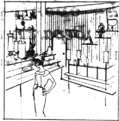
The Lamp and Gift Shop