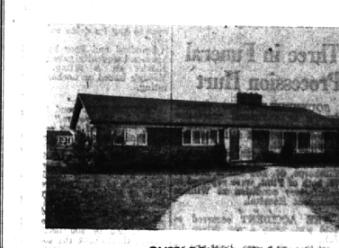
OVERLOOKING GILBERT LAKE

INC. REALTORS BIRMINGHAM OFFICE 345 S. Woodward Ave. MI 6-7900 BLOOMFIELD OFFICE 4114 W. Maple Rd. MA 6-2595 CHARTER MEMBER NATIONAL ASSOCIATION OF REALTORS INTER-CITY REAL ESTATE REFERRAL SERVICE, INC. from cities across America . . . buyers for Birmingham & Bloomfield homes.