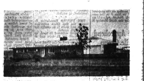
COUNTRY ATMOSPHERE, TEN MINUTES FROM TOWN

Here is the opportunity to acquire your home in this most desired location for $29,500.