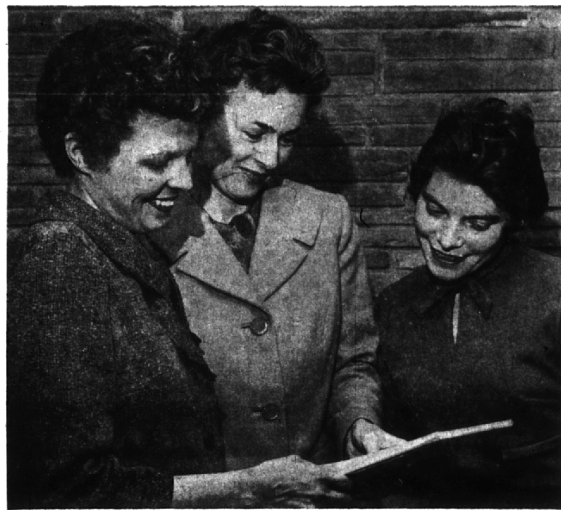
Smiling Sorority Sisters

Arrangements for the spring dinner dance of Detroit North Suburban Alpha Phi takes a lot of planning but these three sorority sisters are enjoying themselves neverthe-