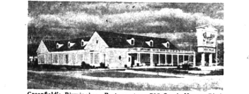
Greenfield's Birmingham Restaurant — 725 South Hunter Blvd.

Greenfield's Carry-Out Service... a quality source of appetizing and appealing food items for parties, picnics or pot-ows. Phone today or any day from 11:30 a.m. to 7 p.m. to meet your needs for any last minute or unusual occasion or merely to vary your usual routine. At the time you designate, your order will be carefully packed and ready for you.