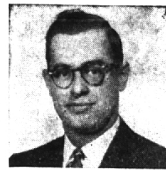
U. of M. All-American Swimmer and Diver