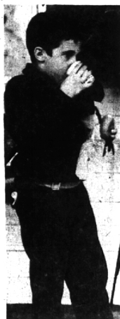
Sipping cider threw one young visitor into deep reflections.