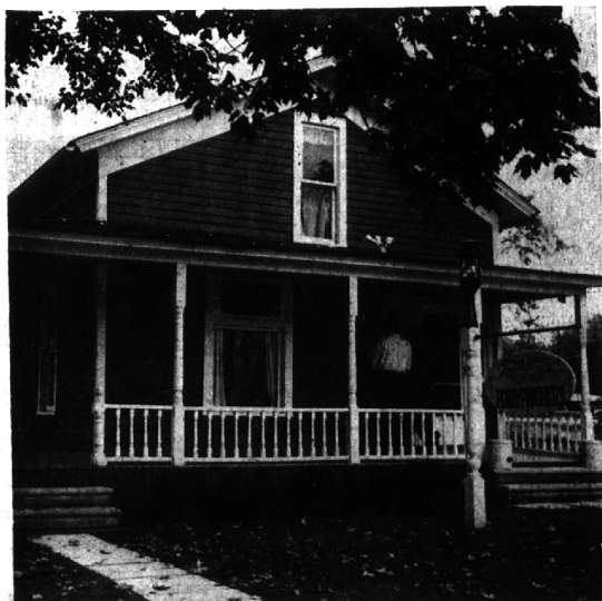
A new addition to the Franklin road scene this fall is The Pennypinchers. The store is housed, Franklin stove and all, in this 100-year-old structure.