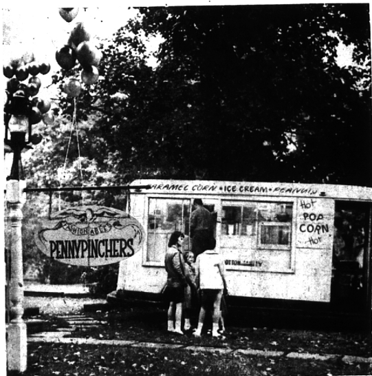
A favorite through the ages, good old-fashioned popcorn, was available to visitors at a stand outside the Pennypinchers store.