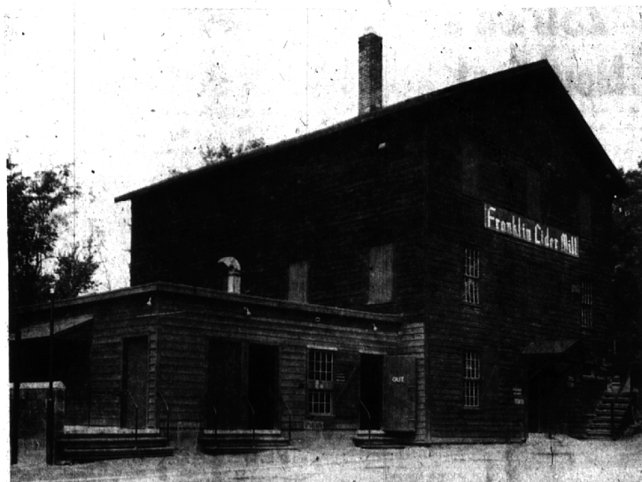
Most famous Franklin landmark of all, the cider mill, draws thousands yearly to see the big presses operate as they have for over a century. The mill is at 14 Mile and