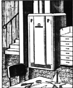
Quiet even-burning glacial flame eliminates blowback and soot. No need for large capacity air line, quiet operation.

Call Dealer In Your Area—Ask For Home Demonstration KALTZ FUEL INC. 730 E. 3 MILE, FARMDALE LI 1-0510 — JO 4-6408 TORRENCE OIL CO. 2205 HOLLAND, BIRMINGHAM MI 4-9800 HOLDEN FUEL CO. 31505 STEPHENSON HWY., MADISON HEIGHTS, LI 7-1300