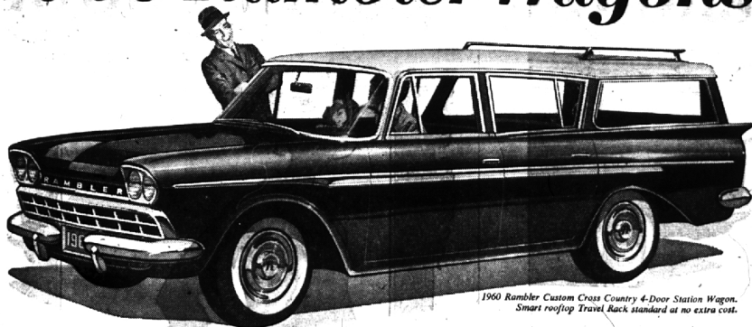
1960 Rambler Custom Cross Country 4-Door Station Wagon. Smart rooftop Travel Rack standard at no extra cost.

Now own Rambler—the world's most popular 6-cylinder wagon—for less than you'd pay for most sedans!