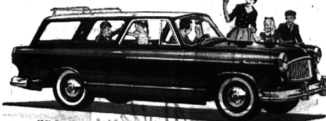
1960 Rambler American Custom 2-Door Station Wagon.

Today! Get the wagon buy of your life at your Rambler dealer's BIRMINGHAM RAMBLER, INC., 666 S. WOODWARD AVENUE