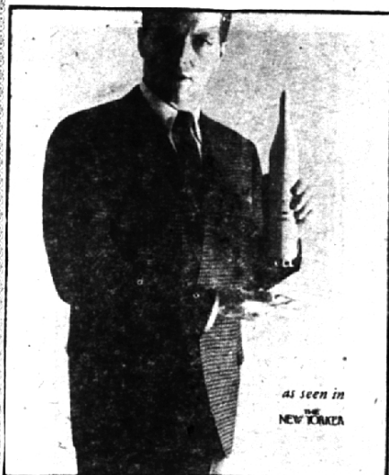
as seen in NEW YORKER

"Antique bronze" arrives on the footwear fashion scene. That's the word from Higgins & Frank. This luxurious new leather shade is a rich, dark, modulated brown—selected for wear with fall's newest apparel tones. This slip-on style features an up-swept profile and a new "sock top," elasticized for ankle-snug fit.