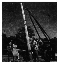
Watch a hole being dug and a telephone pole erected. See new-type trucks, a "must" for gadget-lovers.

Have an electronic computer tell you the day of the week you were born. Refreshments. Balloons and coloring books for the children.