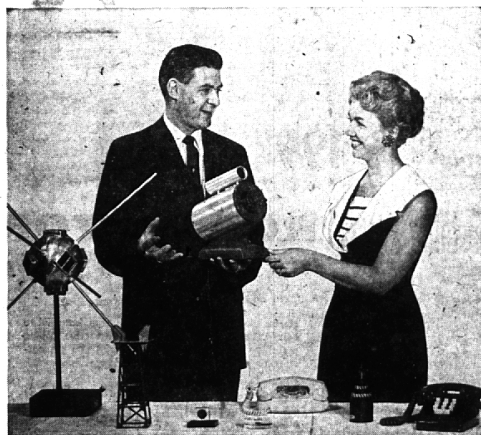
See an exciting preview of the future—"Tomorrow's Telephone Magic"—at the Telephone Office Center, Southfield and Northwestern, Sunday between 1 and 5 p.m. There'll be many surprising things for the entire family to see and do.