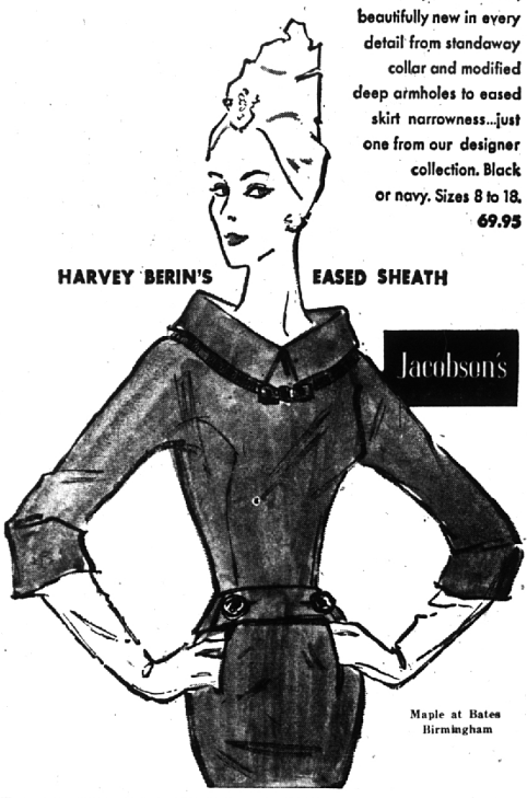
Maple at Bates Birmingham

In wool crepe...a most cosmopolitan sheath, beautifully new in every detail from standaway collar and modified deep armholes to eased skirt narrowness...just one from our designer collection. Black or navy. Sizes 8 to 18. 69.95