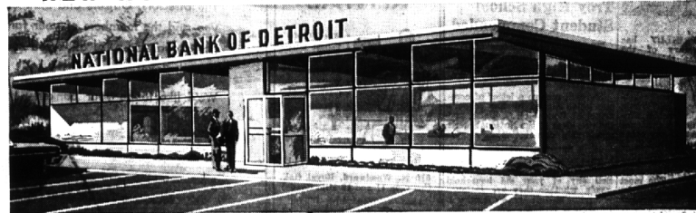
Open for regular business beginning Monday, October 24