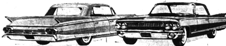
The Fleetwood Sixty Special

of course, seeing isn't everything—and you cannot possibly appreciate Cadillac's remarkable riding qualities, its almost incredible ease of handling, until you have driven the car. While you're at the show, make arrangements for a demonstration drive with your authorized Cadillac dealer. We look forward to your visit.